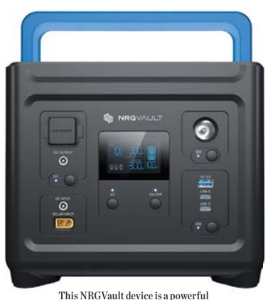
This NRGVault device is a powerful and portable power station – perfect for that camping trip.